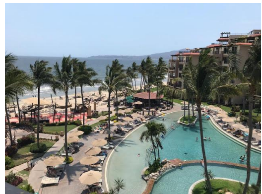
View from our fifth floor balcony. Pool chair view.

We stayed at the Villa del Palmar Flamingos Resort. The resort sits on Banderas Bay, and is known for its golf courses, and long, sandy Nuevo Vallarta beach.