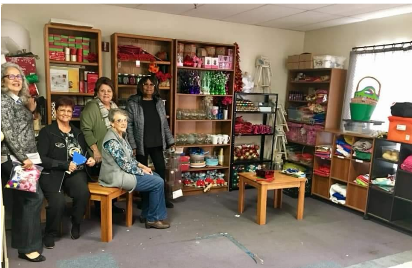
Salvation Army gets facelift from SIMV members on activity room