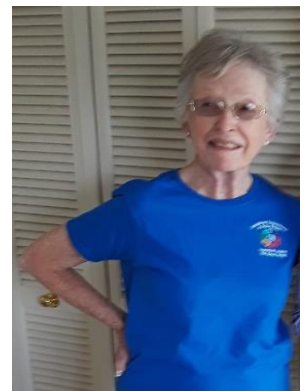
Bottle caps for dialysis

REMINDER: BRING THOSE FINAL BAGS OF WHITE CAPS FOR ELLA!