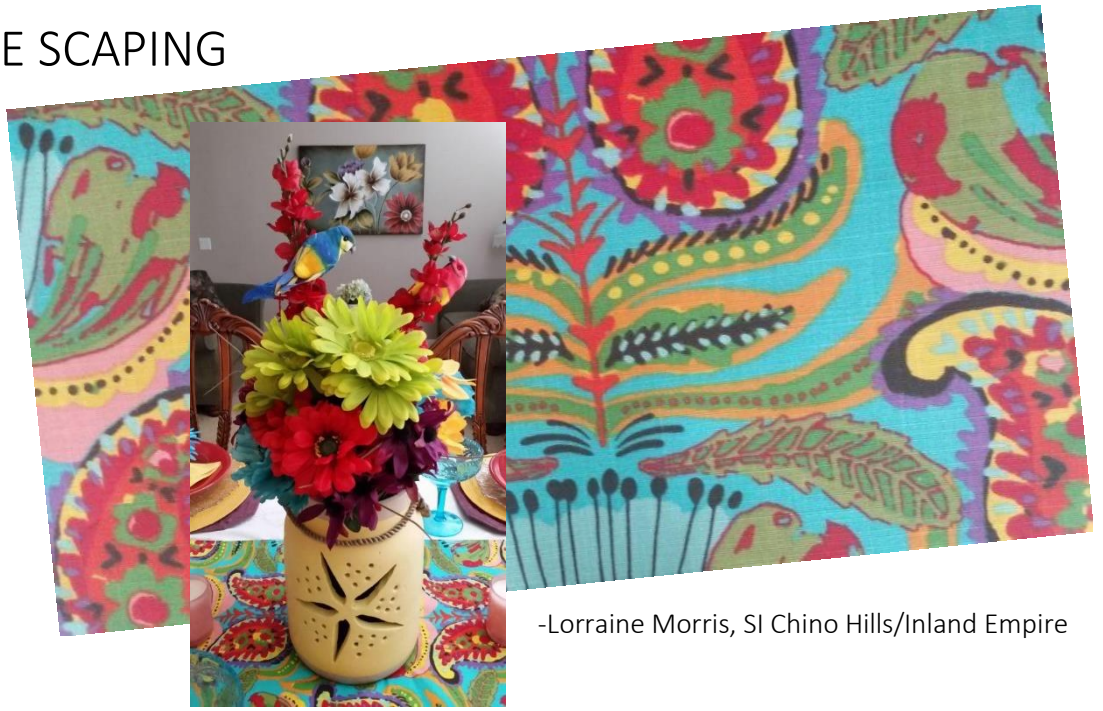
-Lorraine Morris, SI Chino Hills/Inland Empire

This month's table scape is all about color. Several years ago, I bought this table runner from World Market and I pulled the colors from it to complete the look. Colors included teal, purple, red, yellow, pinks and greens.